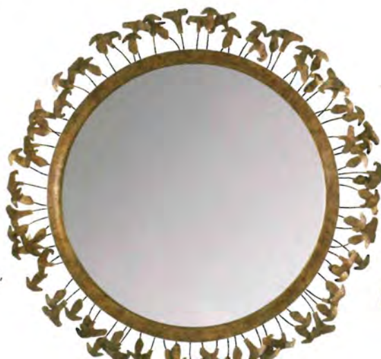
'Mushroom' mirror, £3,192, Porta Romana