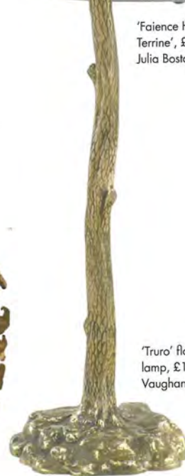
'Truro' floor lamp, £1,710, Vaughan