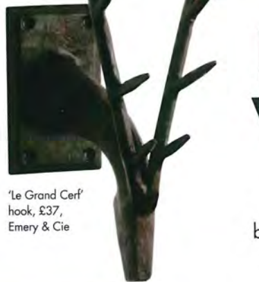
'Le Grand Cerf' hook, £37, Emery & Cie