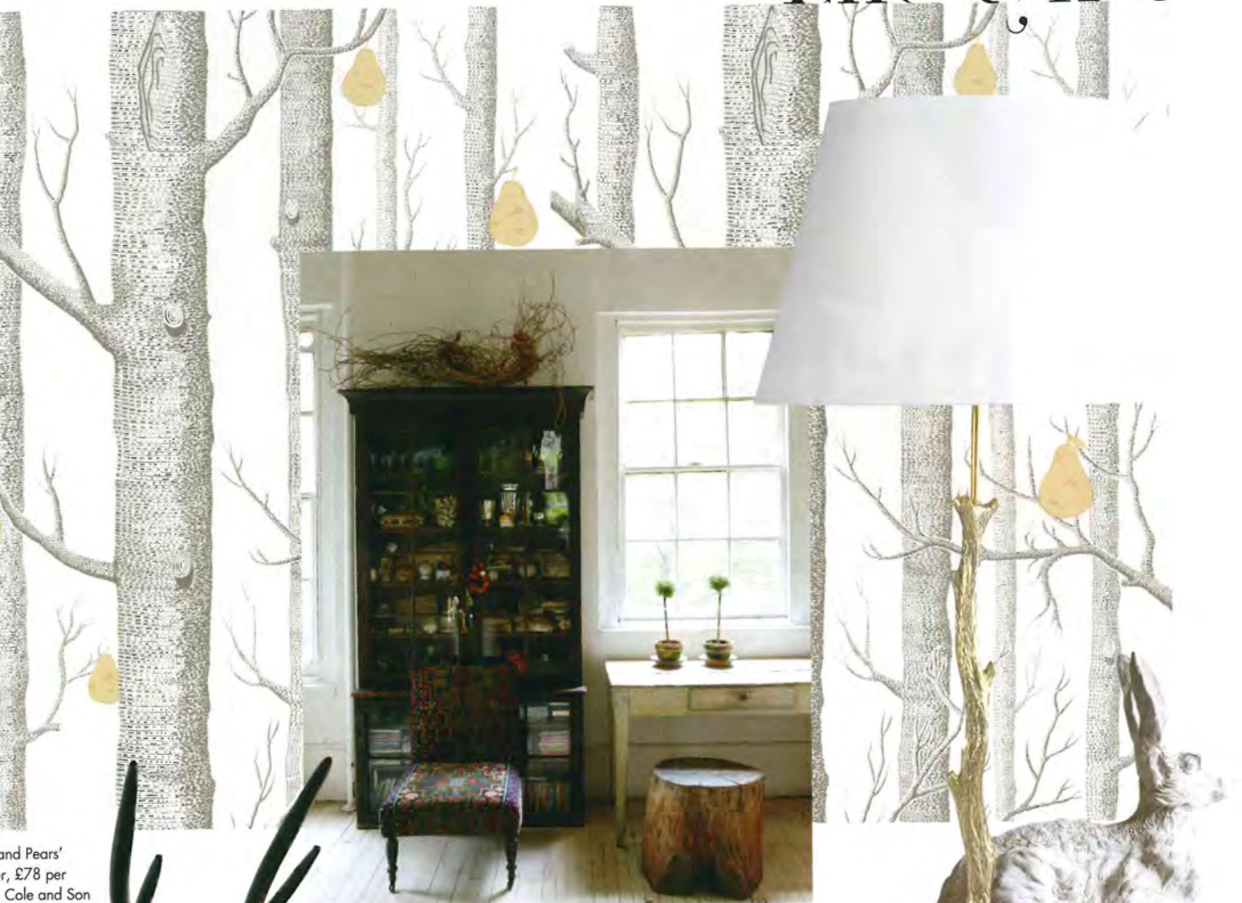
'Pears' lamp, £78 per pair, Cole and Son