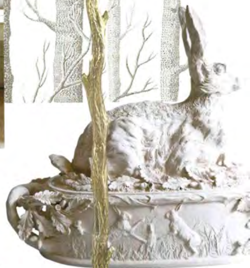
'Faience Hare Terrine', £4,268, Julia Boston, 1st Dibs