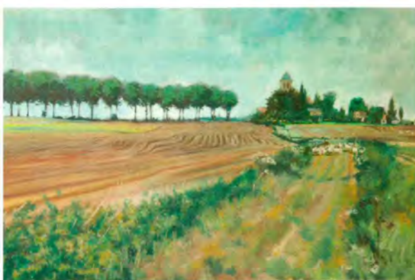
Get inspiration from original paintings such as this one of Le Tremlay, Bazoches-sur-Guyonne. Original oil painting on canvas, 48in by 38in, £1,600, Make The Most Of (01244 345954; www.makethemostof.co.uk)

Accessories should be kept to a minimum. Displays of favourite earthenware and pottery are ideal. Arranged on open shelving, on a dresser or even mounted on the wall, pieces in deep green, red, umber or amber glazes will help to accentuate the quintessential French country feel.