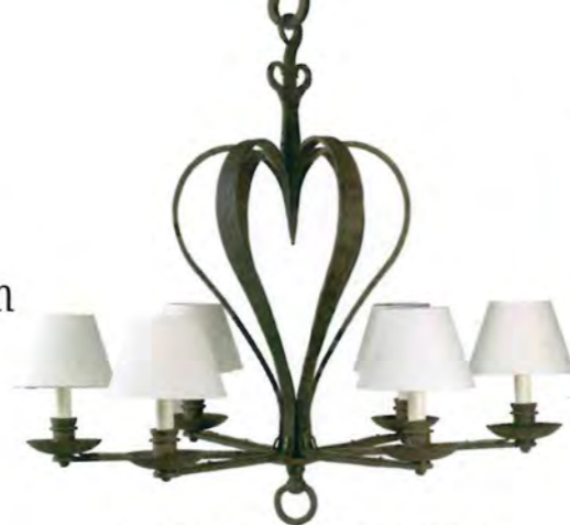
Bastille chandelier in a rust finish, £2,610, shown with 7in Empire lampshades, £27 each, Vaughan (020-7349 4600; www.vaughandesigns.com)