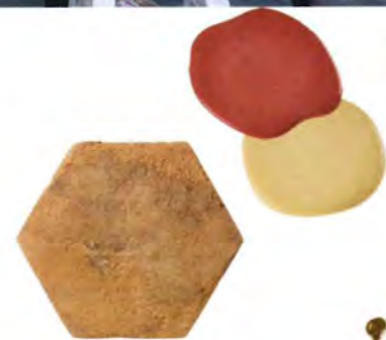
Reclaimed terracotta hexagon tiles (15cm by 17cm (6in by 6½in)), £129.60 per sq m, Fired Earth (0845 366 0400; www.firedearth.com)