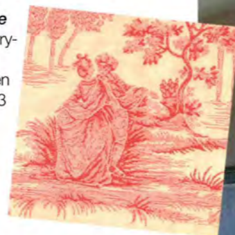
Valbonne toile de Jouy in ivory-red (149504) and ivory-green (149506), £373 per m, C&C Milano (020-7751 4554, www.ccc-milano.com)