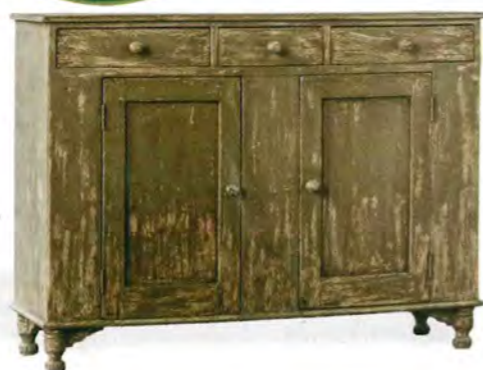
RLH Collection farmhouse sideboard , £3,225, Ralph Lauren Home (020-7535 4600; www.ralphlaurenhome.com)