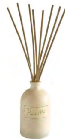
Poire 1796 taper diffuser from the Abbaye range, £22, Illumens Candles (01787 282012; www.illumens-candles.co.uk)