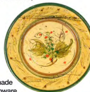
Handmade earthenware Gauthier platter 40cm (16in), £155, Divertimenti (0330 3330351; www.divertimenti.co.uk)