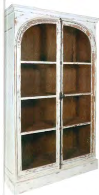
Hogarth vitrine in aged antique white with dark-wood interior and glass windows, £2,700, Nicholas Haslam (020-7730 8623; www.nicholashaslam.com)

FOR SALE £2.95m This stylish five-bedroom house just outside St Rémy comes with a fully equipped one-bedroom caravan 'annexe' and a large swimming pool. £2.95m through Knight Frank (020-7861 5034)