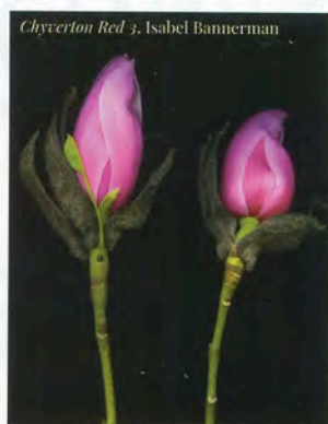
Chryserion Red 3, Isabel Bannerman

Spring Exhibition: Flowers & Still Lives 11-26 April jonathancooper.co.uk