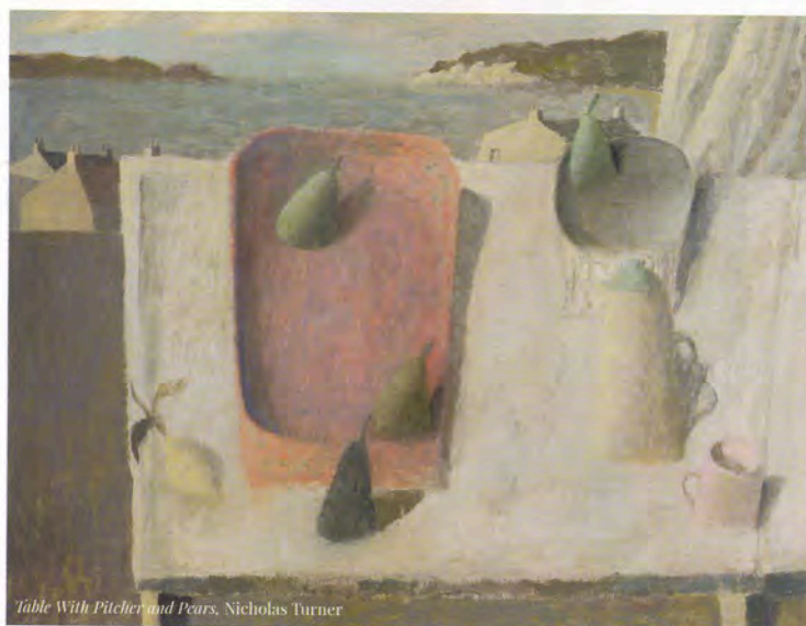
Table With Pitcher and Pears, Nicholas Turner