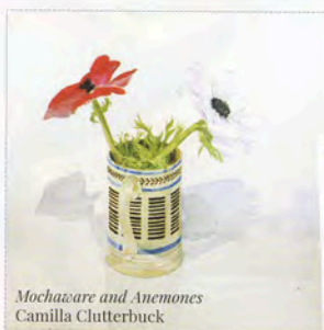
Mochaware and Anemones Camilla Clutterbuck