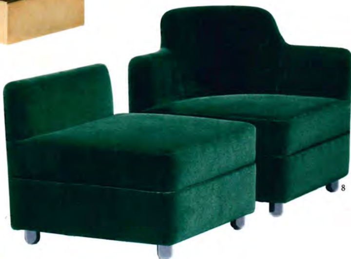
1 'Lescar Pelmet PST2453-01-X01' tassel, £450, Watts of Westminster. 2 'Luna' mirror, by Laura Kirar, £3,911, Baker. 3 'Petra Bel Air' chandelier, £22,230, Wired Custom Lighting. 4 'Voltaire' slip-over table, £1,732, Christopher Guy. 5 From left: brass 'Copnall' cube uplighter, £191; brass 'Curtis' cube angled uplighter, £198; both Vaughan. 6 'No. 1039' doorknob, from $800, Nanz. 7 'Issey' wall sconce, £695, Paolo Moschino for Nicholas Haslam. 8 From left: 'P12 Angolo' stool, by Corrado Corradi dell'Acqua for Azucena, £3,070; 'P12 Angolo' small corner armchair, by Corrado Corradi dell'Acqua for Azucena, £3,224; both GMR Interiors. All prices include VAT. For suppliers' details see Address Book >