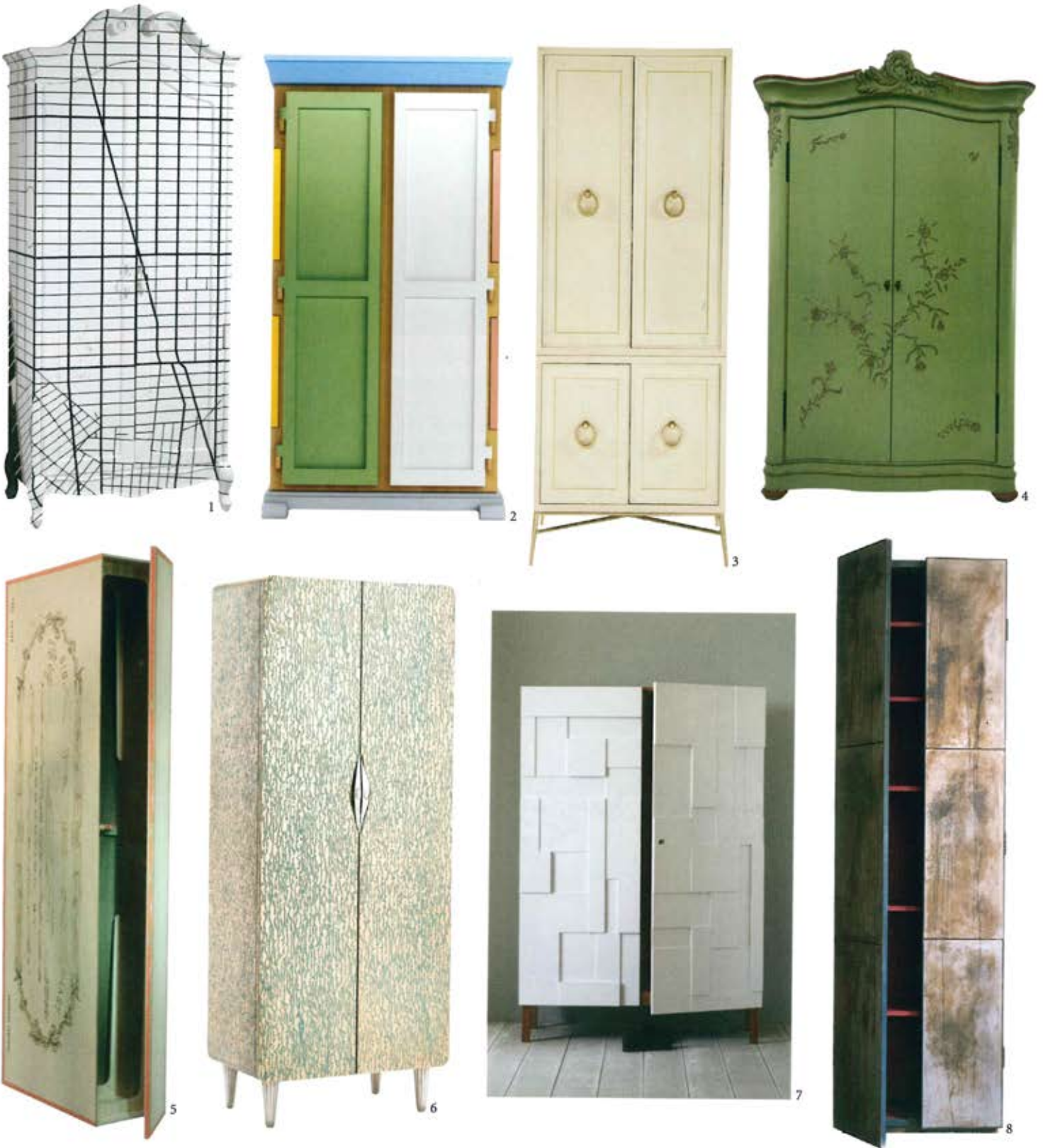
1 'Natalia Contemporary White Grid' armoire, by Seletti, £1,495, Out There Interiors. 2 'Paper Patchwork', by Studio Job, £4,087, Moooi. 3 'Salon' cabinet, by Bernhardt, £4,200, Paolo Moschino for Nicholas Haslam. 4 'Floral', £6,950, And So To Bed. 5 'Extended Cigar Box', by Studio Wieki Somers, £17,025 approx, Droog. 6 'Diliana', £32,550, Francis Sultana. 7 'Alba', £5,925, Pinch. 8 Tarnished-steel cupboard, £7,362, Ochre. All prices include VAT. For suppliers' details see Address Book ▷