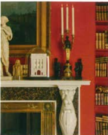
'Soho Home' furniture and accessories; roof terrace at 11 Howard; fabrics from Evitavonni's 'Tour' collection; fireplace by Tim Gosling for Chesneys

■ Tim Gosling has worked with Chesneys to create two timeless fireplaces. The interior designer was inspired by the architectural treasures he discovered while visiting Pompeii. For both designs Gosling has used Italian statuary marble for the decorative elements against panels of black and gold Portoro marble. The 'Pompeii' is a robust and dramatic composition featuring monopedic lions with an ornate register grate, while the 'Rome' features a brass register grate, decorative detailing and classical jamb panels. Chesneys, 194-200 Battersea Park Rd, London SW11 (020 7627 1410; chesneys.com ) ■