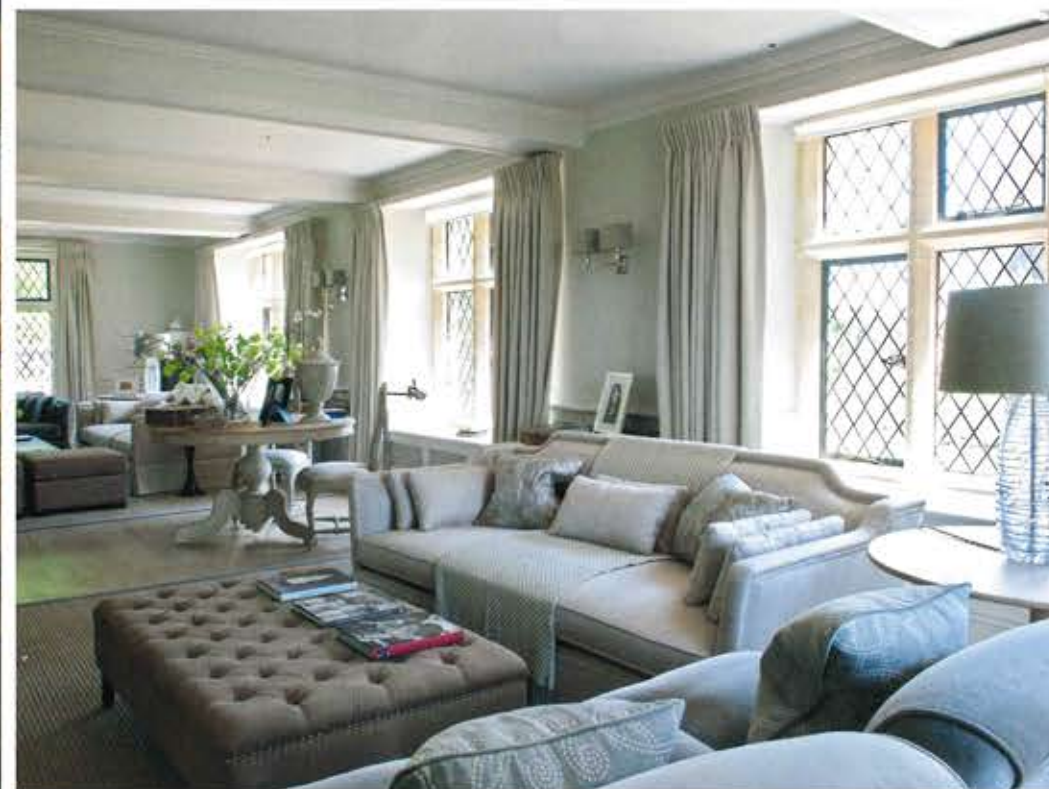
Easy elegance is the key to Emma Sims Hilditch's contemporary country style

They say 'The eight designers have more than 150 years of collective experience'